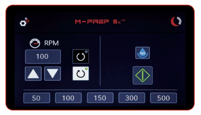
The 7" color LCD touchscreen is used to control all functions and is extremely easy to navigate, allowing greater efficiency among users.