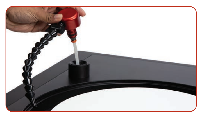
Retractable coolant nozzle allows quick and easy sample/bowl cleaning.